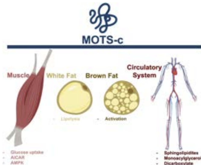
Fig. 2. Biological effects of MOTS-c. MOTS-c has been shown to act on muscle, white fat, brown fat, and circulate in the periphery.

action includes signaling through a trimeric receptor consisting of WSX-1, GP130 and CNTFR as well as a separate FRPL1 receptor [22,23] (Fig. 1). Downstream of humanin receptor activation are STAT3 and ERK1/2, which modified mitochondrial biology, cell proliferation, and cell survival [24]. In essence, humanin helped initiate the novel field of mitochondrial sORF-encoded microproteins (see Fig. 2).