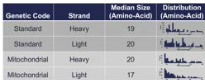
Fig. 3. Classes of MDPs. Putative MDPs can be classified into four categories based on genetic code and strand specificity. The distribution graph on the far right illustrates putative MDP length (i.e., number of amino acids).

the mitochondrial genome to include sORFs between 9 and 40 amino acids revealed hundreds putative MDP sORFs that can be separated into four classification categories based on the strand of origin (heavy or light) and genetic code (i.e., standard or mitochondrial-specific genetic code). There are several differences between the mitochondrial-specific genetic code and standard genetic code. The standard genetic code uses AGA and AGG codons for arginine, whereas the mitochondrial genetic code uses these codons for termination [41]. The UGA codon is used for termination in the standard genetic code, but the mitochondrial genetic code uses UGA for tryptophan [42]. Mitochondrial-specific genetic code also uses two alternative initiation codons (ATA and ATT) in addition to the standard initiation codon of ATG [43].